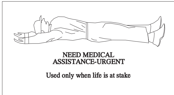
FIG 6-2-3 Urgent Medical Assistance